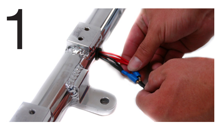
connect wires x4

For items purchased from a dealer or distributor, please contact them directly and we will work through them to resolve any support issues. Items purchased through a domestic dealer or international distributor cannot be returned directly to Aerial Wakeboarding. Any duties, freight, taxes, customs fees and installation costs are non-refundable.